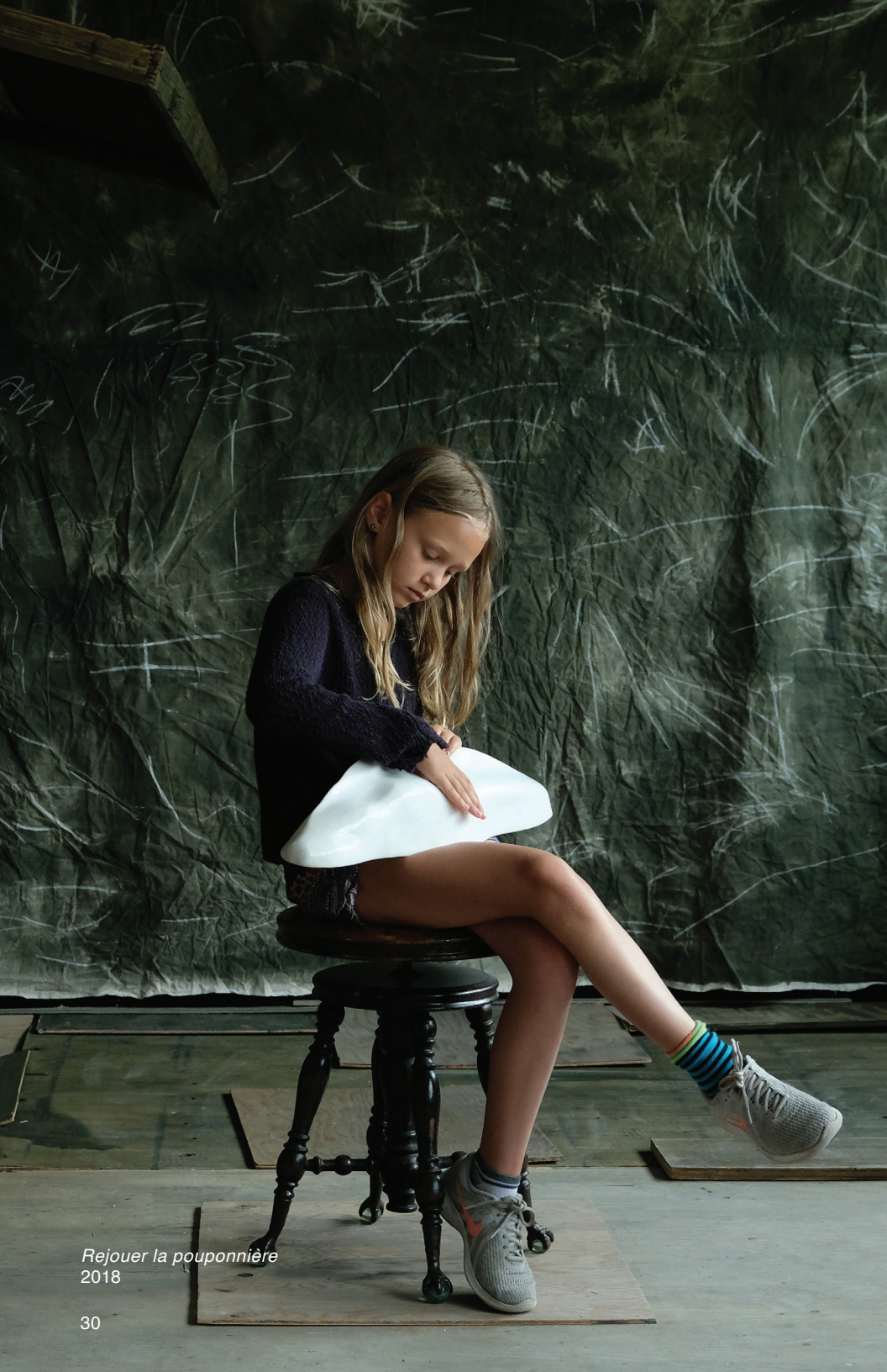
Rejouer la pouponnière 2018