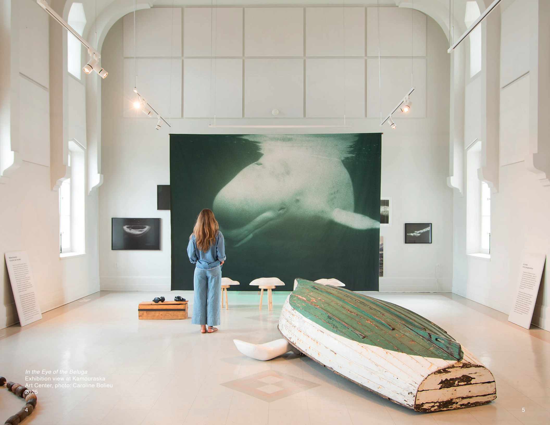
In the Eye of the Beluga Exhibition view at Kamouraska Art Center, photo: Caroline Bolieu 2025