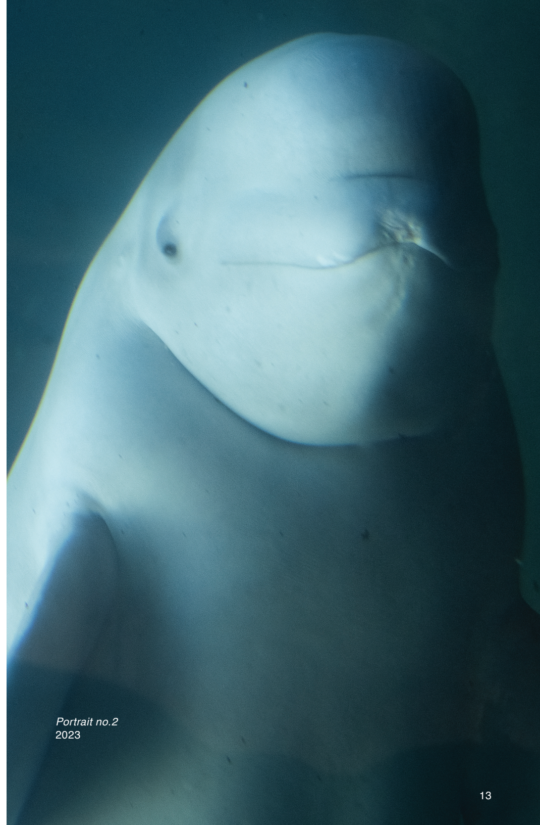
Portrait no.2 2023