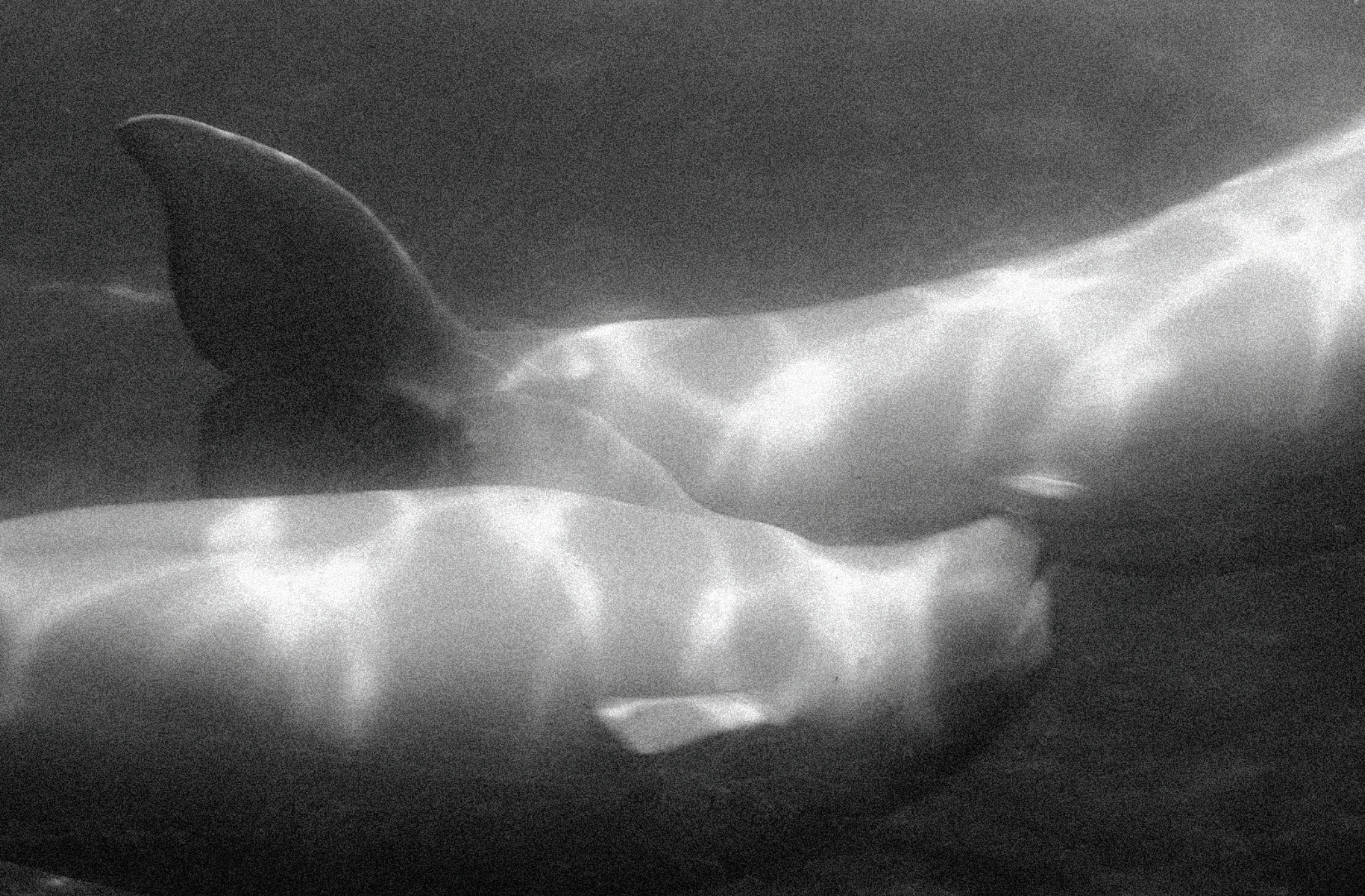
Le lait du béluga (no. 1) 2017