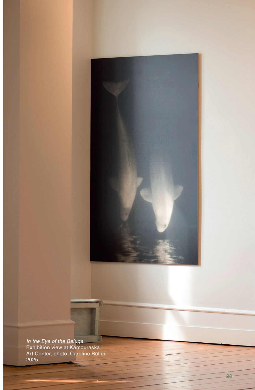
In the Eye of the Beluga Exhibition view at Kamouraska Art Center